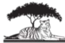
CROWN RIDGE TIGER SANCTUARY