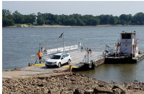
Modoc/St. Genevieve Ferry